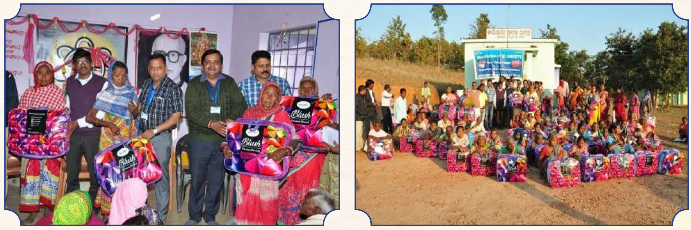
Distribution of Blanket to the to the Poor/Needy people

NSPCL has been tirelessly supporting needy & poor people in surrounding downtrodden villages of the vicinity since the inception of the CSR activities.