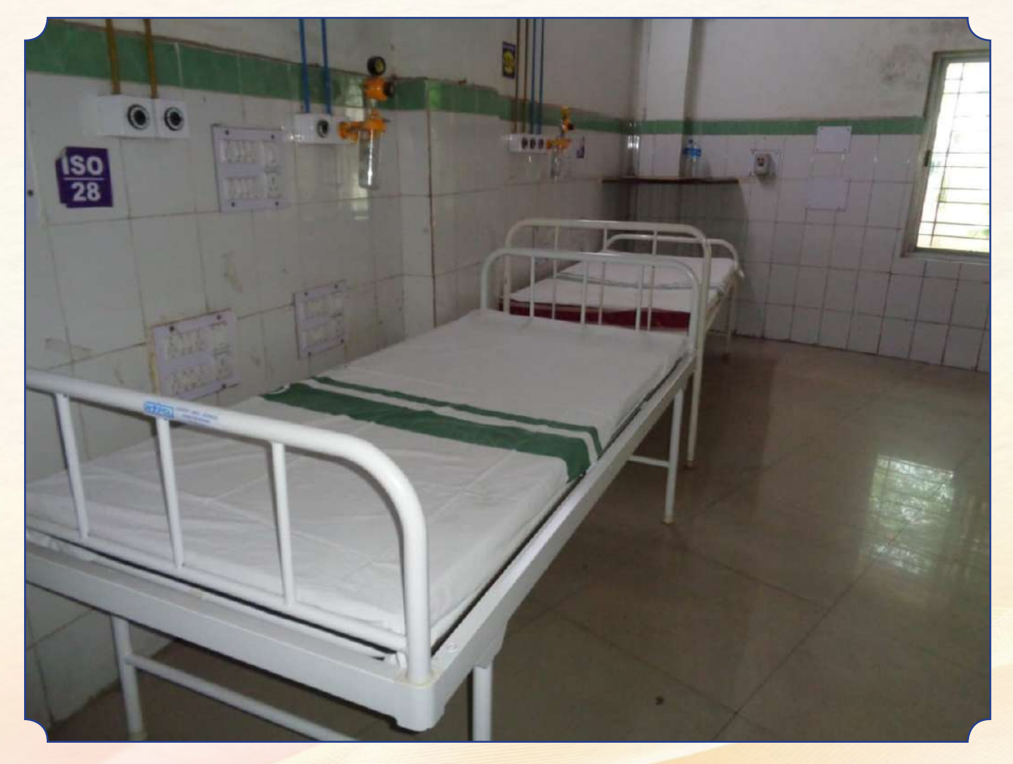
Provided 98 nos. Semi-fowler beds with mattresses to Rourkela government hospital