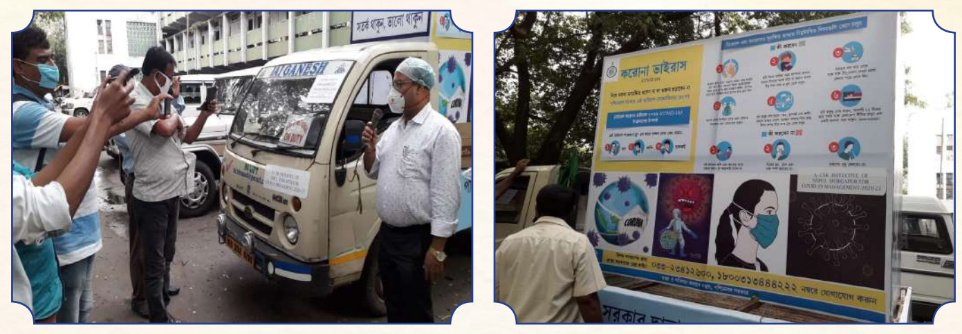
Awareness on COVID 19 precautions

NSPCL worked relentlessly for adoption of Covid appropriate behavior by employees, contractual workers and people in vicinity.