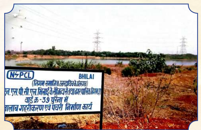
Deepening of Pond at Purena Village, Bhilai