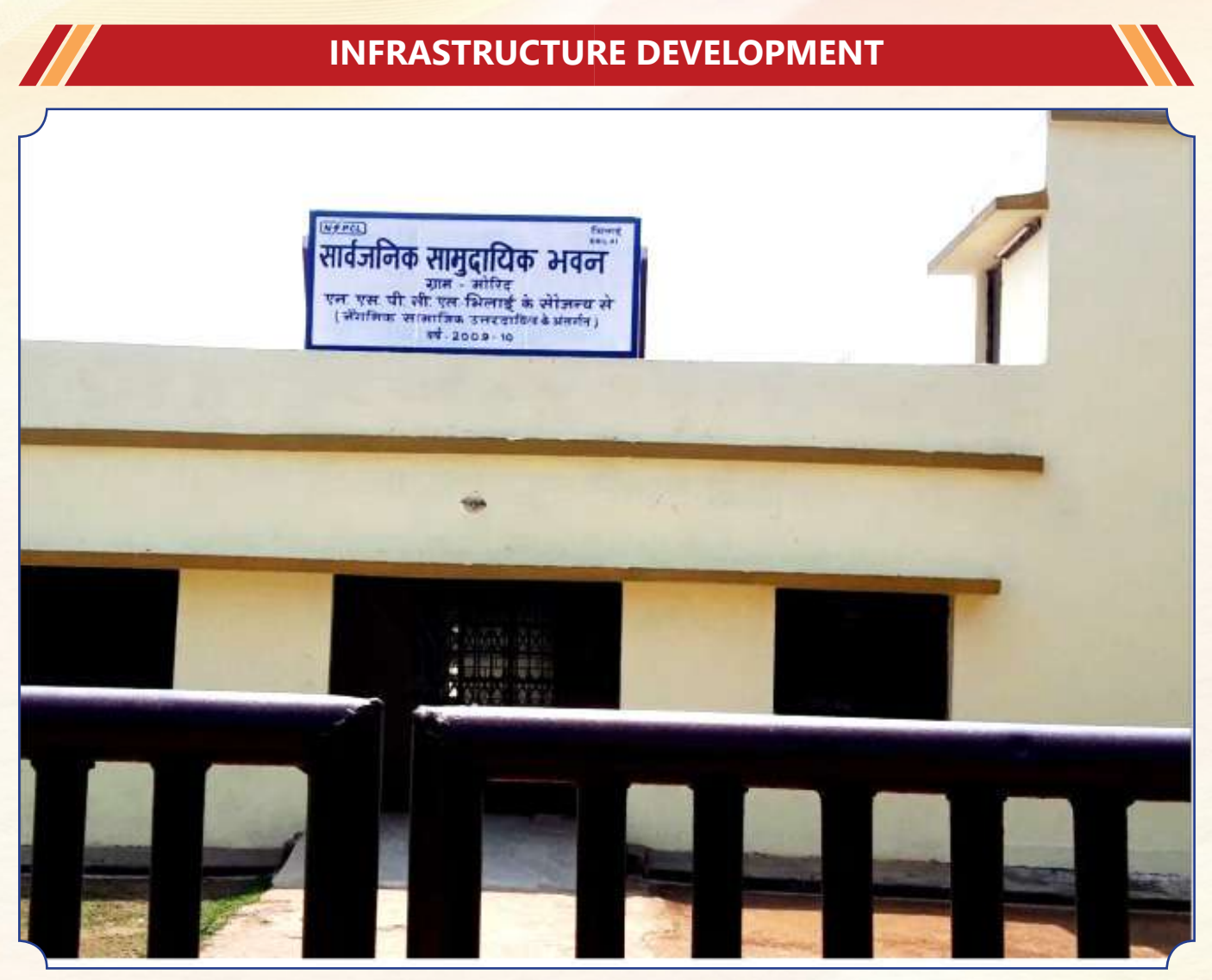
Construction of Samudayik Bhawan in Morid Village, Bhilai