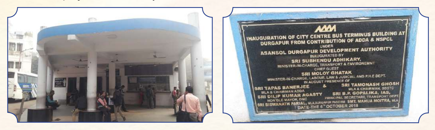
Renovation and beautification of Bus stand at City Centre, Durgapur through Asansol Durgapur Development Authority.

NSPCL, in extension of its role in development of power infrastructure, has taken up several initiatives for infrastructural developments in other aspects too, especially in underdeveloped areas including tribal villages with special emphasis on the areas in and around the projects financed by NSPCL.