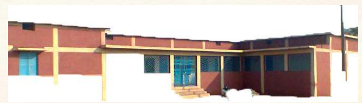
Whitewashing in Government School, Sirsakala Village -Bhilai