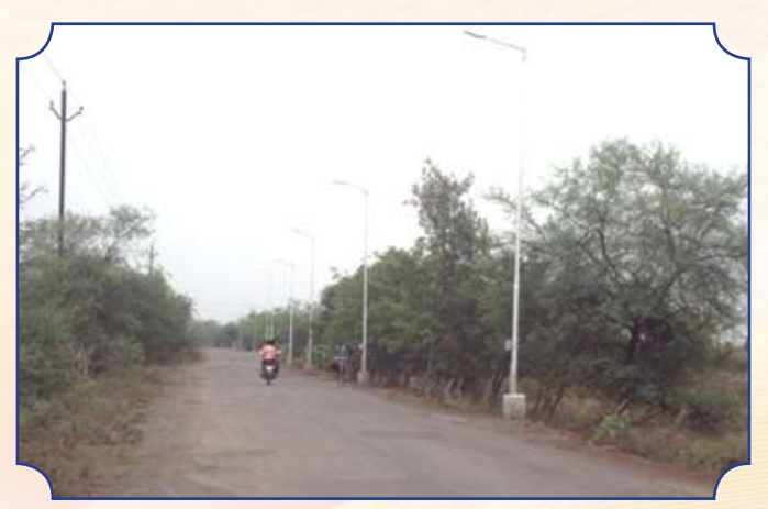
Erection of Street Lights from Sirsa Chowk to Somni Village, Bhilai