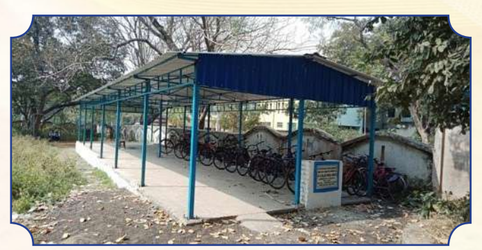
Cycle stand at RECM School, Durgapur