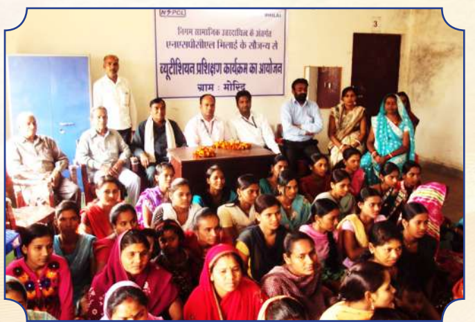
Beautician programme in Morid Village-Bhilai