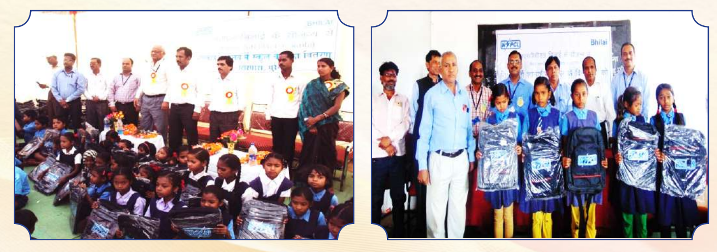
School Bag distributed at Purena, Bhilai