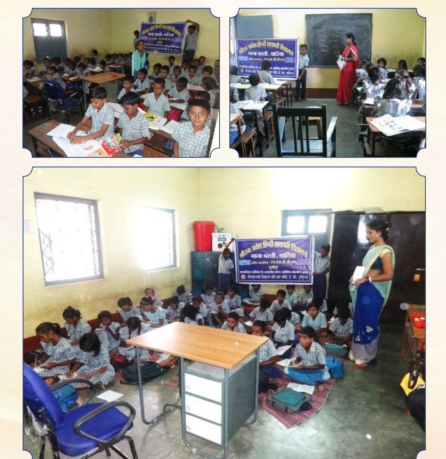
Running pre-primary & primary formal school (number of students----at Mana village