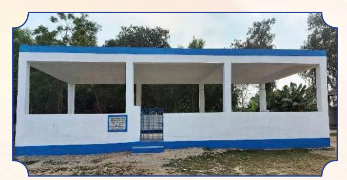
Dining Hall at Bijra High School, Durgapur