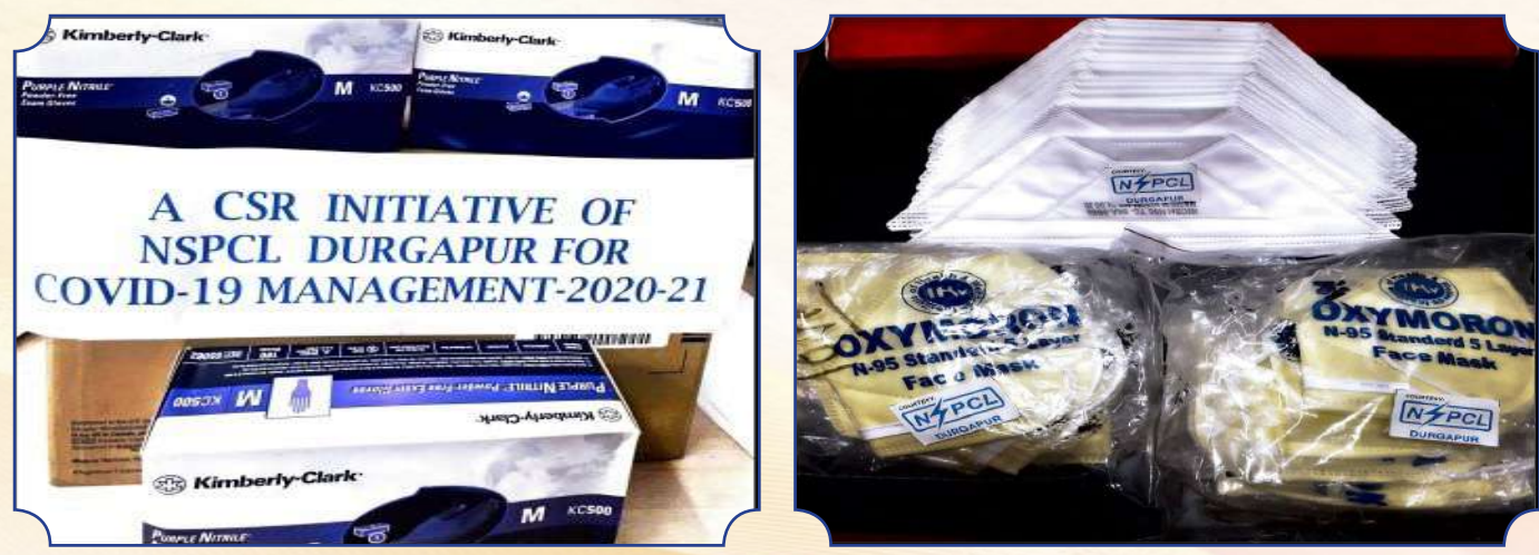
PPE Kit for Covid-19 management Face shield and Sanitizer distribution