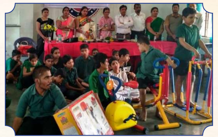
Distribution of physiotherapy instruments to specially abled Children at Bhilai