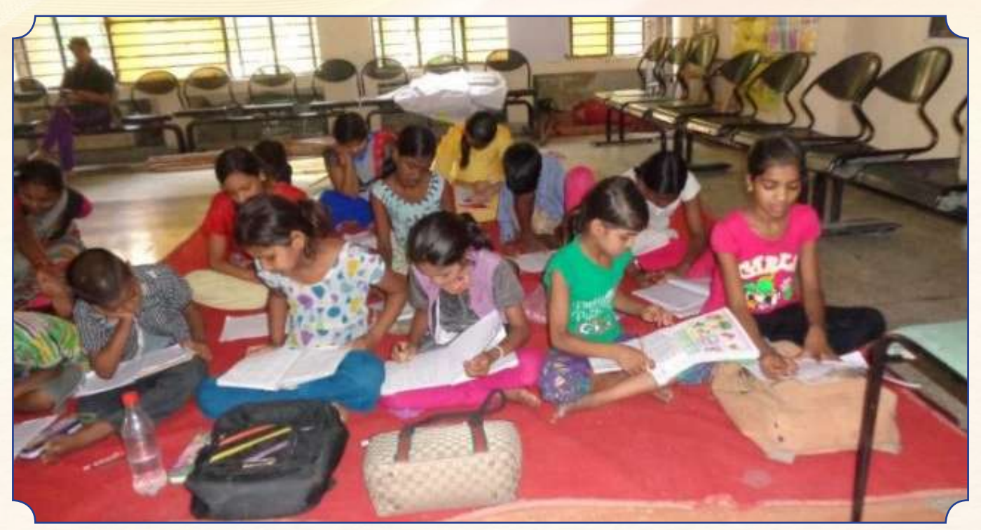
"Quality infrastructure has a huge impact on the learning outcomes"