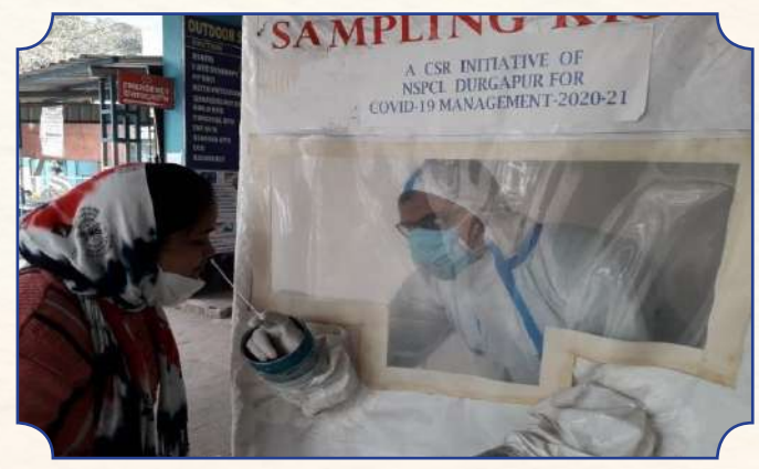
COVID Testing Kiosk for Sample Collection