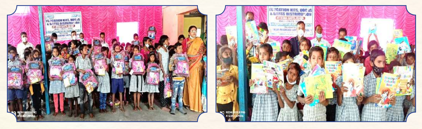
School Bag & Books distributed at Mana Basti, Durgapur