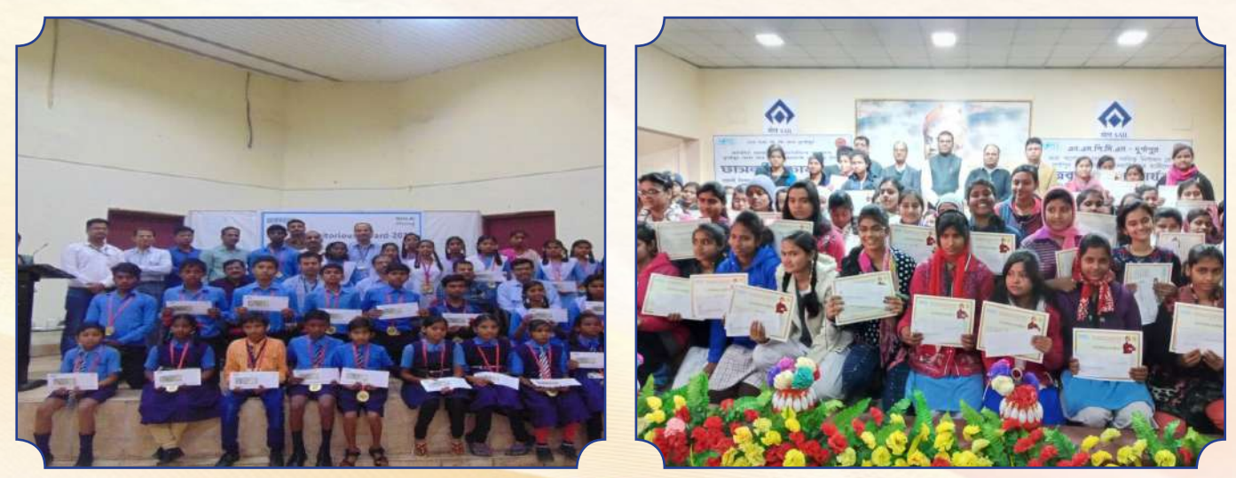
Meritorious student award function at Bhilai and Durgapur

NSPCL provides scholarship to meritorious students as well as residential coaching/ intensive mentoring for competitive entrance examinations.