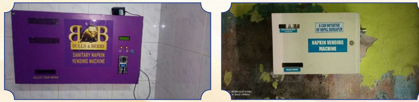
Two nos. of Sanitary Napkin vending Machine were installed at i) Durgapur Women's College ii) Pandit Raghunath Murmu Abasic High School and related unit for disposal of used napkins.

NSPCL has taken a massive campaign for hygiene awareness among adolescent girls in schools, colleges, and nearby villages. The programme is being hugely appreciated all around Durgapur.