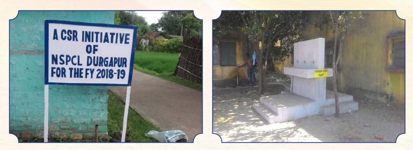
Water facility at schools & villages at Durgapur and nearby areas