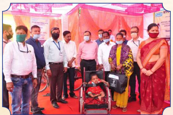
Distribution of Aids & Assistive Devices to differently abled persons at Rourkela