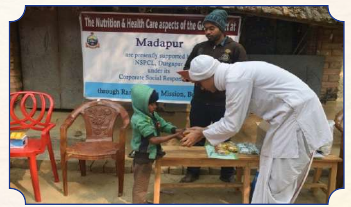
Food Items Distribution- GAP Hazrapara, Murshidabad Madapur, Murshidabad