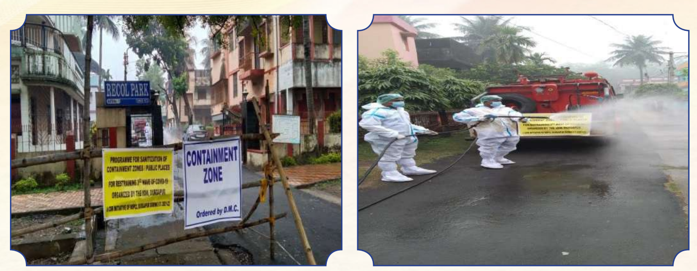
Sanitization of Containment Zone Area [Public Places]