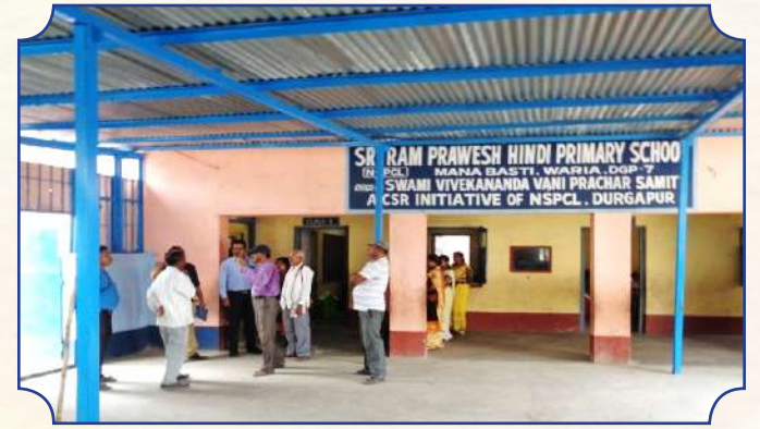
Construction shed at Mana School