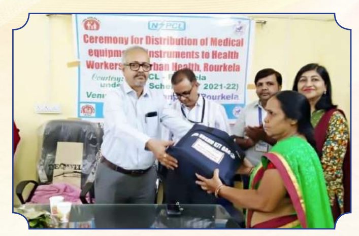
Distribution of Medical Equipment's /Instruments at different Sub-Centres of Urban Primary Health Centers, Rourkela