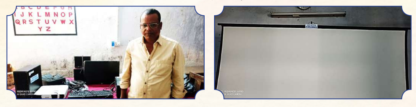
Inauguration of Smart Classes at Govt Schools, Bhilai

Provided e-learning infrastructure such as computers and projectors at Bhilai/Durgapur. Beneficiaries – Around 1200 students from 8 primary schools.