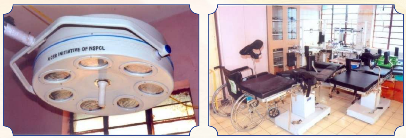
Necessary equipment/instruments were provided to Durgapur Sub Divisional Hospital.

Medical Instruments Providing Basic Microscope for Cataract Operation to Durgapur Blind Relief Society (NGO working for eye care)