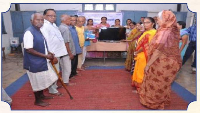
Infrastructural Support in Vriddhashram, Pulgaon-Durg, Bhilai