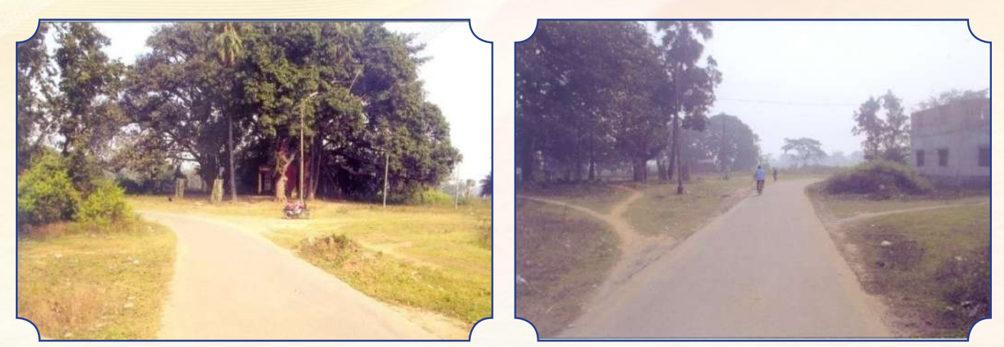
Construction of Roadways at Durgapur