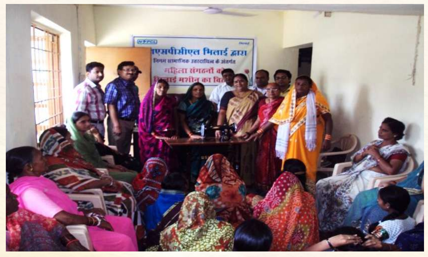
Sewing machine distribution to needy women at Somni Village-Bhilai