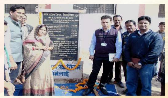
Dedication of Various Civil Work in Purena Village, Bhilai